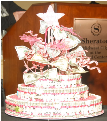
A treasure of a cake—Sweet!

American Fidelity Assurance Company Document Imaging Solutions Southwest Food Service Excellence