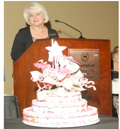
Honored and Speechless...

Thank You for the retirement reception you held in my honor during the opening mixer, and also for the generous gifts. The book will bring back many wonderful memories and the money cake will provide me a cruise to the Bahamas, a trip to Hawaii or a shopping spree! - Just sayin-