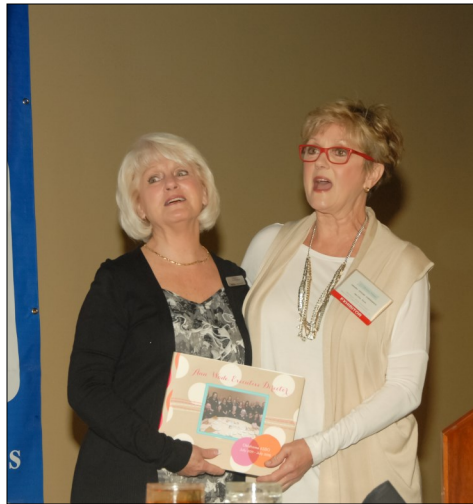
No we aren't singing or "Howling at the Moon" just caught up in the moment....